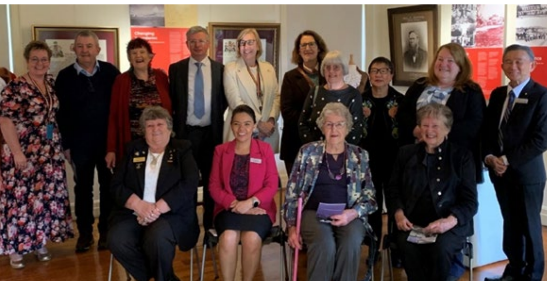
Cultural Heritage Exhibition – ‘Optimism, Opportunities and Achievement’