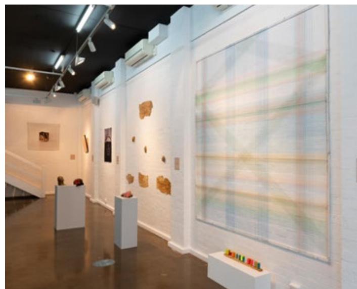
SHE Exhibition, Walker Street Gallery