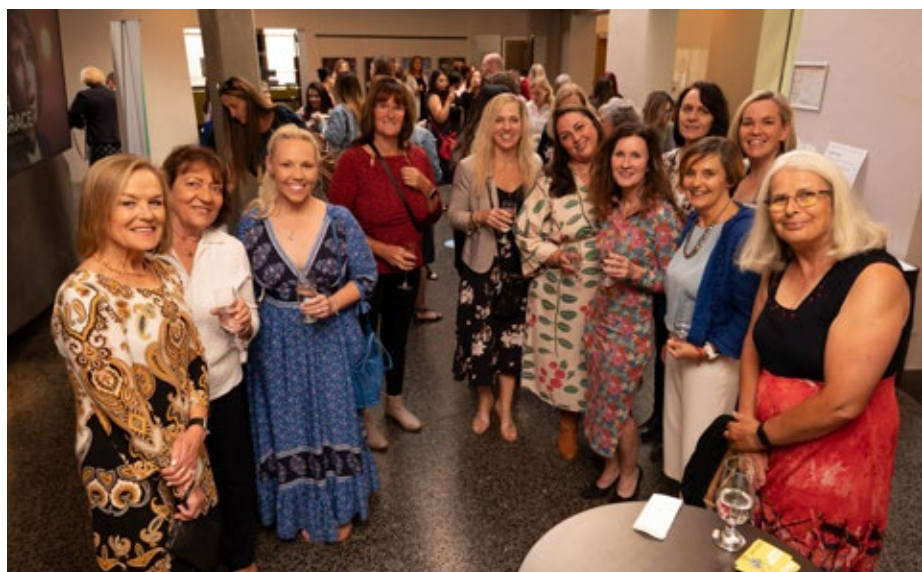
International Women's Day Lunch