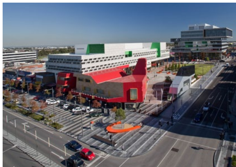
Dandenong Civic Centre