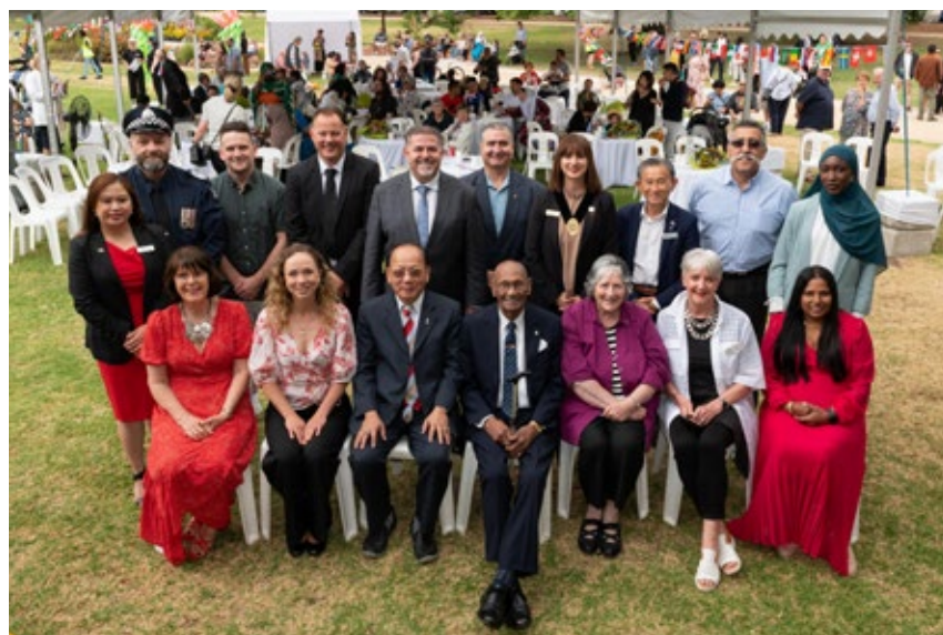
Australia Day 2023 Award Winners