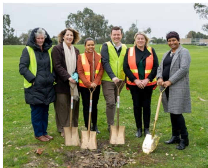
Keysborough South Community Hub Sod Turning