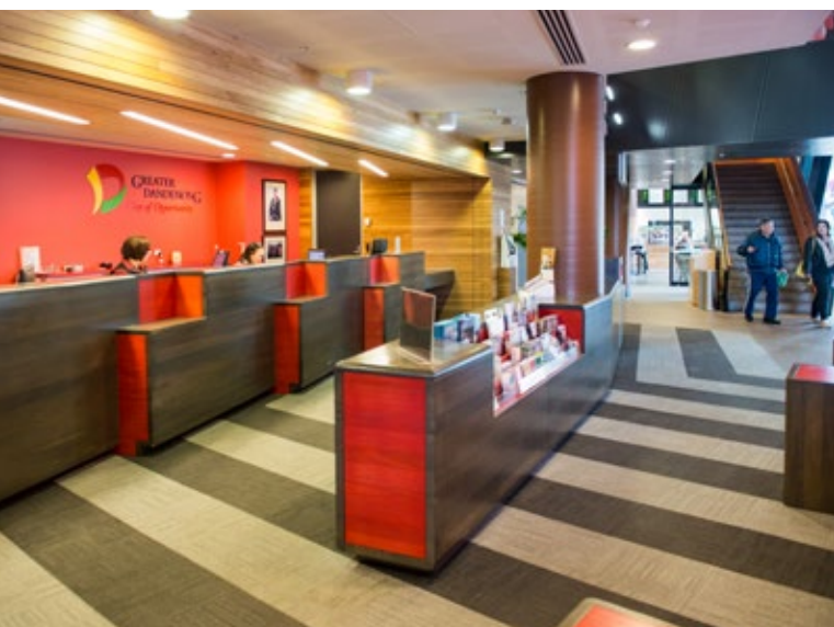
Dandenong Customer Service Centre