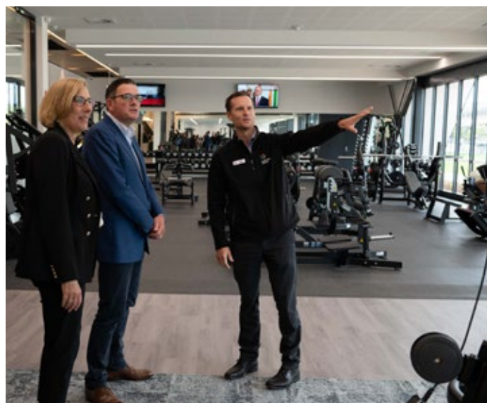
Noble Park Aquatic Centre Gym opening with Premier Daniel Andrews