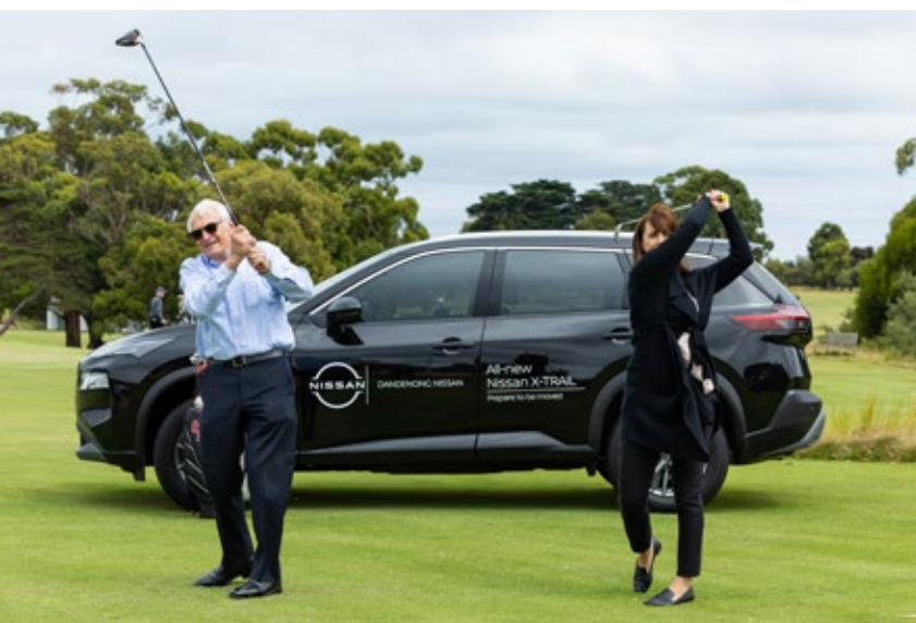
Take a Swing for Charity Golf Day