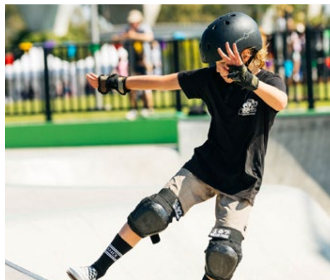
Noble Park Skate Park