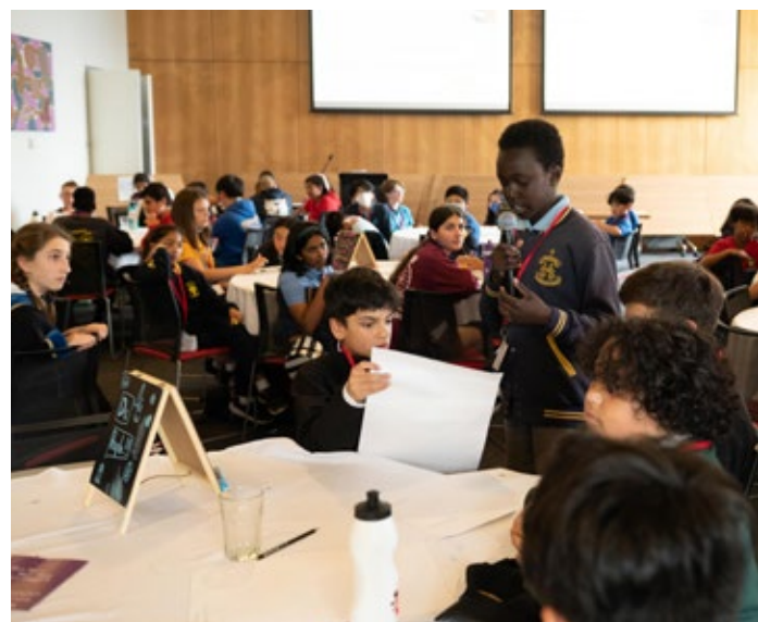
Children's Forum 2022