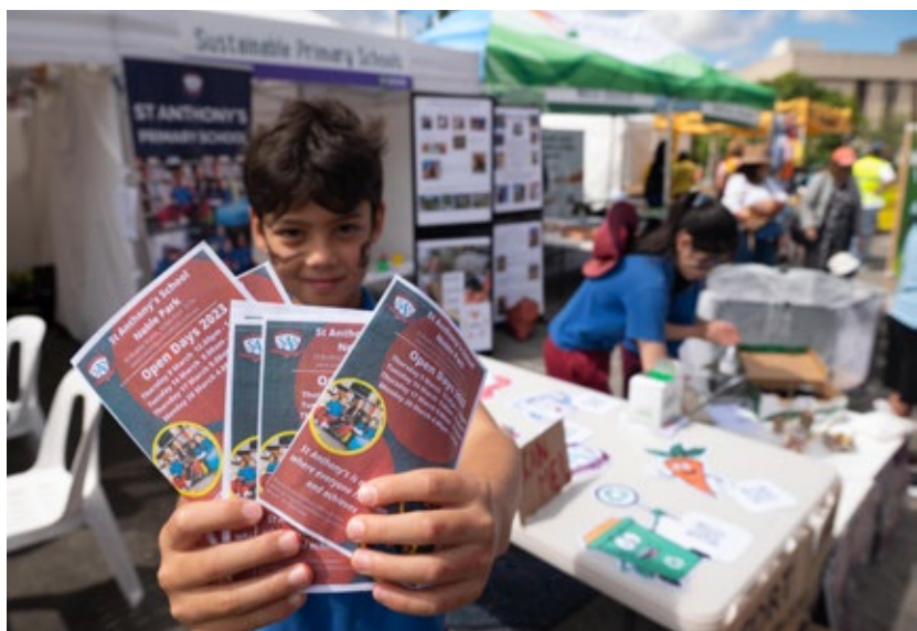
Sustainability Festival 2023