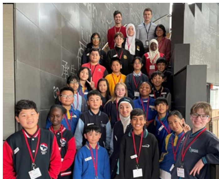
Children's Advisory Group