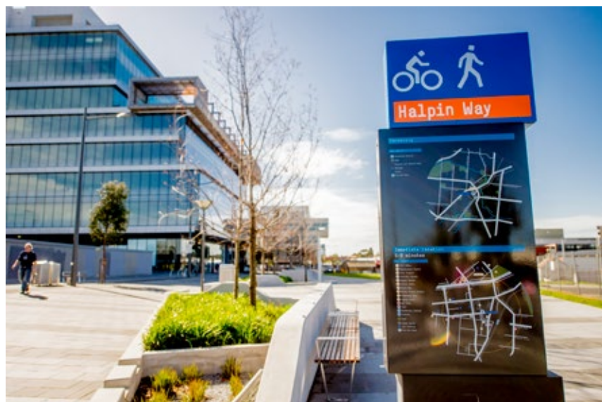
Halpin Way, Dandenong