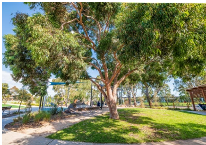
Ross Reserve All Abilities Play Space