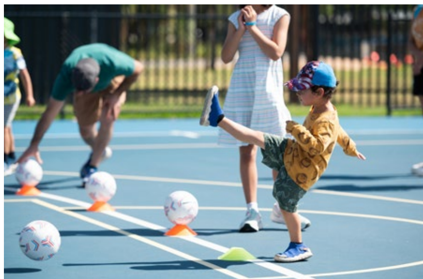
Noble Park Community Fun Day