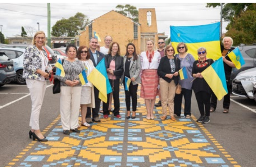
Peace and Harmony for Ukraine mural