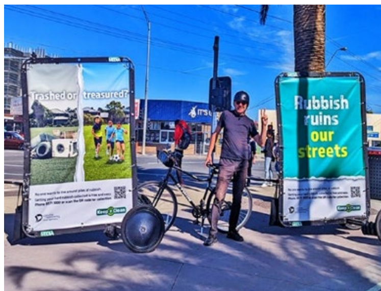
Keep It Clean campaign