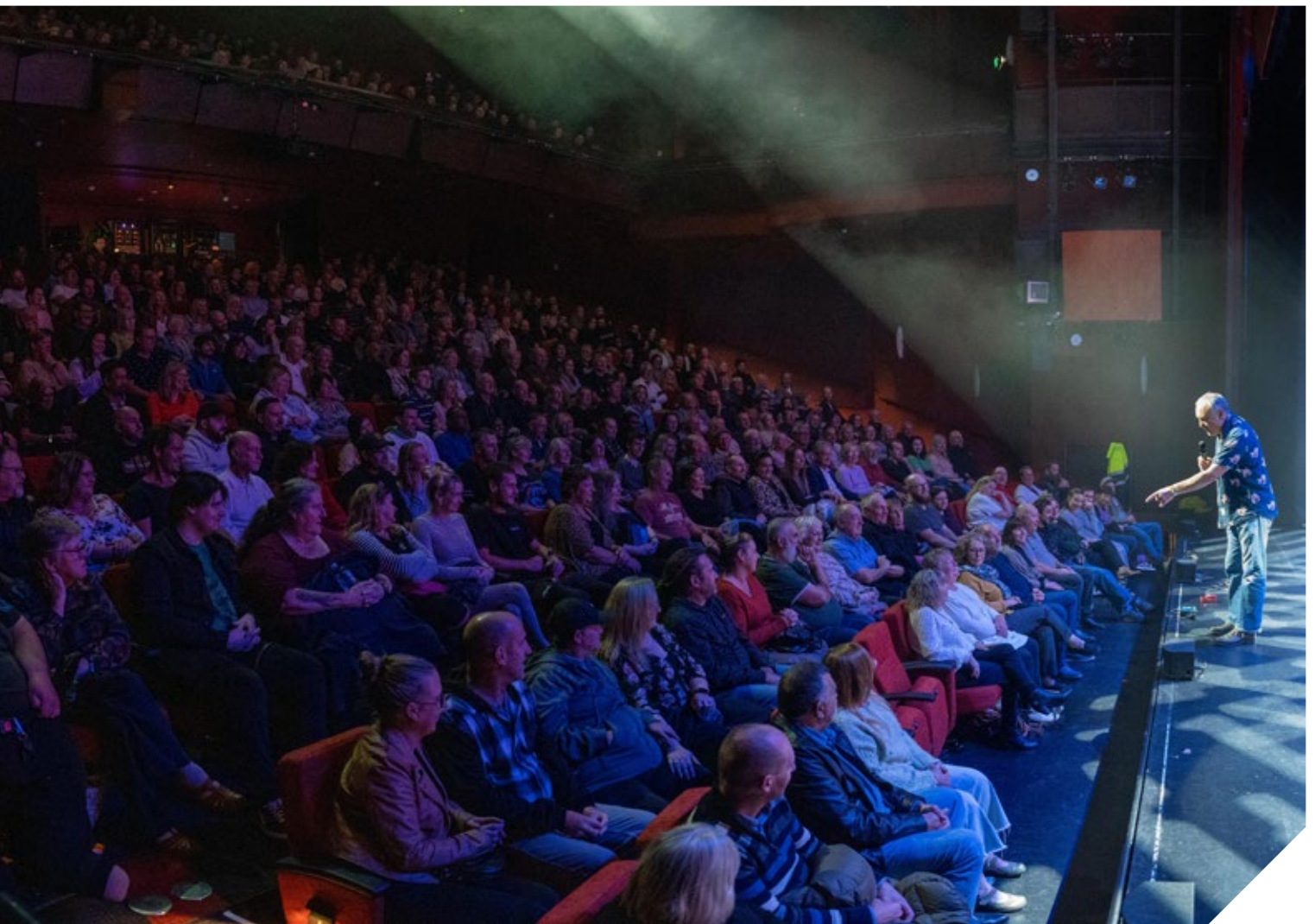
Audience at Jimeoin – The Craic , Drum Theatre, 2023.

“In all the years I have worked at Council I can honestly say I have not experienced the support, attention to detail and professionalism you all provided yesterday ...To one and all you are an exceptional team and I look forward to booking The Drum rooms more often for group events.”