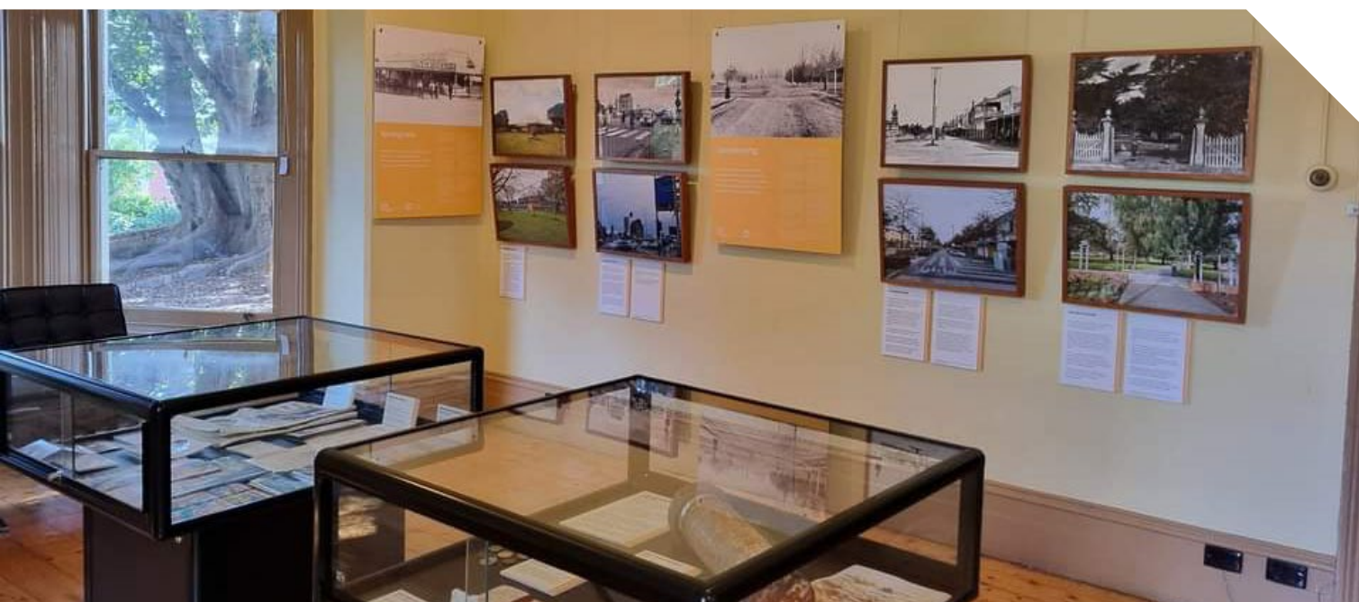
City of Greater Dandenong: Then and Now’ exhibition, Hertiage Hill Museum and Historic Gardens, 2022.

– President, Dandenong and District Historical Society