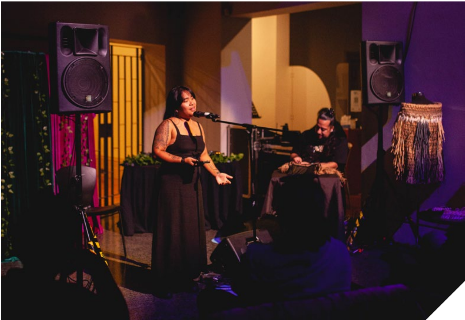
Our Beat Spoken Word event, Multicultural Arts Victoria takeover as part of the In Situ program of events, Drum Theatre, 2022.