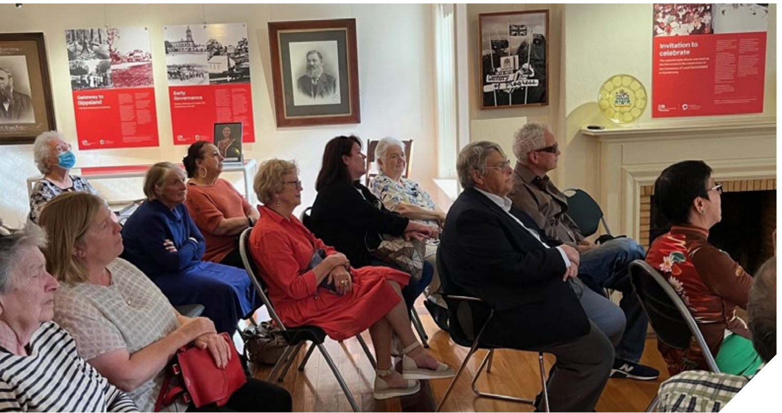
Shared storytelling afternoon tea 'Our home is the City of Greater Dandenong', Heritage Hill Museum and Historic Gardens, 2023.

“A highly informative, wide ranging and interesting presentation. It was well targeted to the audience and there was good follow up response to audience questions. It was an educational talk on a topic not previously aware of. The talk enormously broadened the knowledge base of those who attended the City of Greater Dandenong’s collections, why they are kept and its significance and connection to the community.”