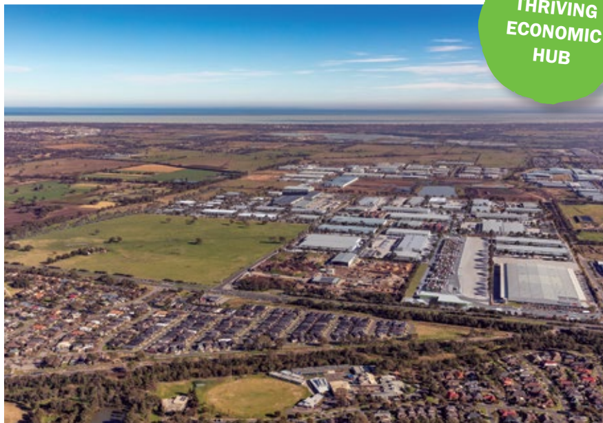
Nexus Dandenong South Industrial Estate.

The City of Greater Dandenong is recognised as Australia's most culturally diverse community, with residents coming from at least 154 different nations.