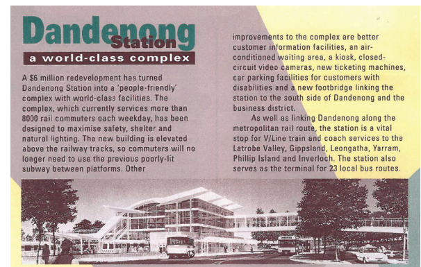
Above: Express Newsletter, Summer 1994, Department of Transport

redevelopment was unlikely in the foreseeable future. Emphasis in the short to medium term in this plan therefore has been placed on advocating for a thorough clean, repainting and washing down of windows and grimy surfaces of the building as well as improvements to maintenance and day to day cleaning. It is expected that these improvements would assist in promoting changed attitudes to the station, when coupled with the completion of other actions in this plan.