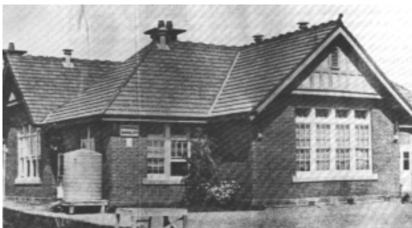
Figure 20. Springvale State School c1923 (Hibbins)

Eumemmering No. 244 became a State School in 1873, but in the hard days of the 1890s depression the older pupils had to transfer to Dandenong No. 1403 and only the infant classes remained on the original site. In 1904 the school was re-