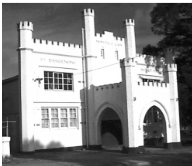
Figure 34. Armytage Own Scout Hall