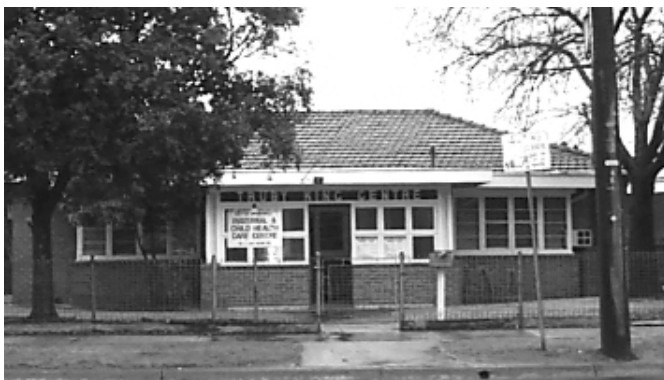
Figure 36. Truby King Centre, Springvale