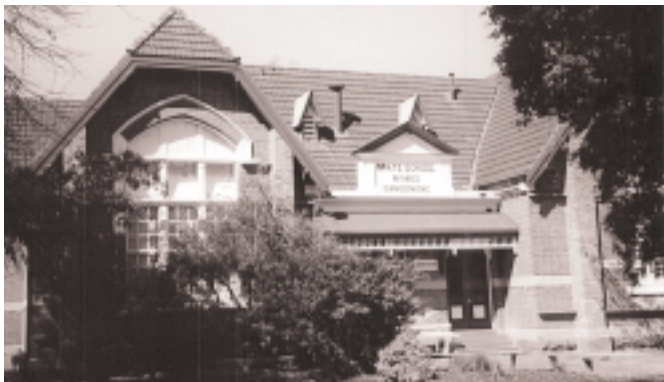
Figure 19. Dandenong State School c1907 (Brennan)