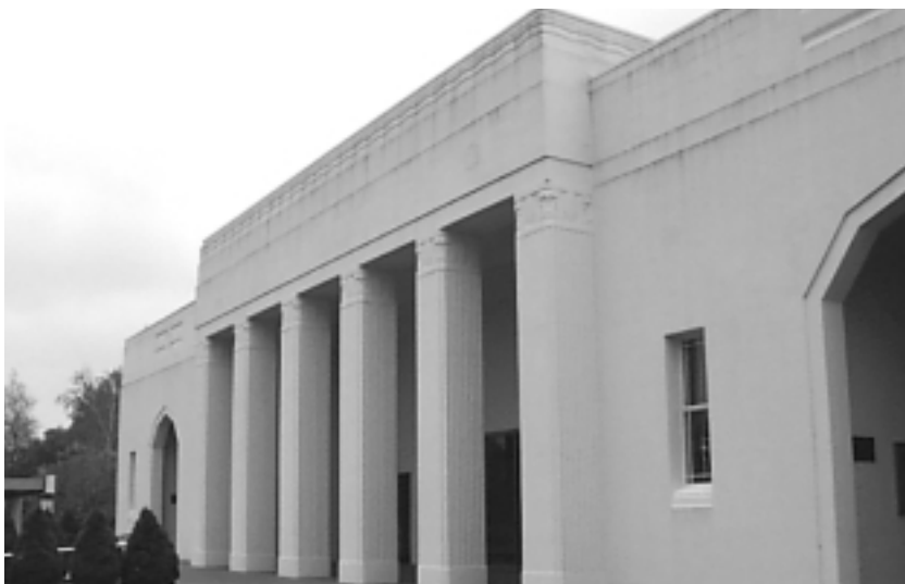
Figure 38. JA Boyd chapel, Necropolis

The Springvale Cemetery opened in 1902, the final stage of a process which had begun 24 years before, initiated by the Victorian Government. It was created as a metropolitan resource, not as a local amenity, 'a burial ground which in modern times was one of the most remarkable in Australia' (Brennan, 1973: 102).