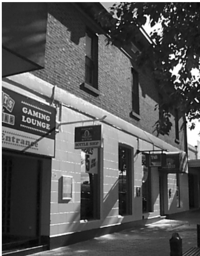
Figure 27. Albion Hotel