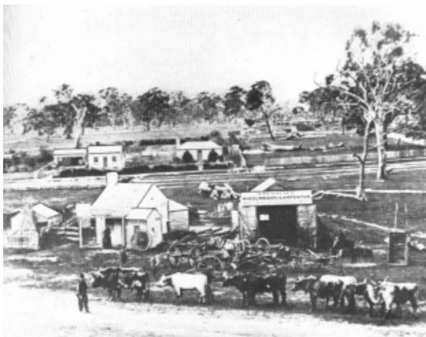
Figure 15. Hemming's workshop, Pultney St, c1856 (Brennan)

Then Dandenong was basically a one-street county town, with shops that benefited greatly from the weekly market. In 1882, the Dandenong Advertiser reported: 'It is a recognised fact that the Dandenong tradespeople take as much money on Tuesdays, as they do on all the other days of the week put together.' ( Dandenong Advertiser , 19 April 1882).