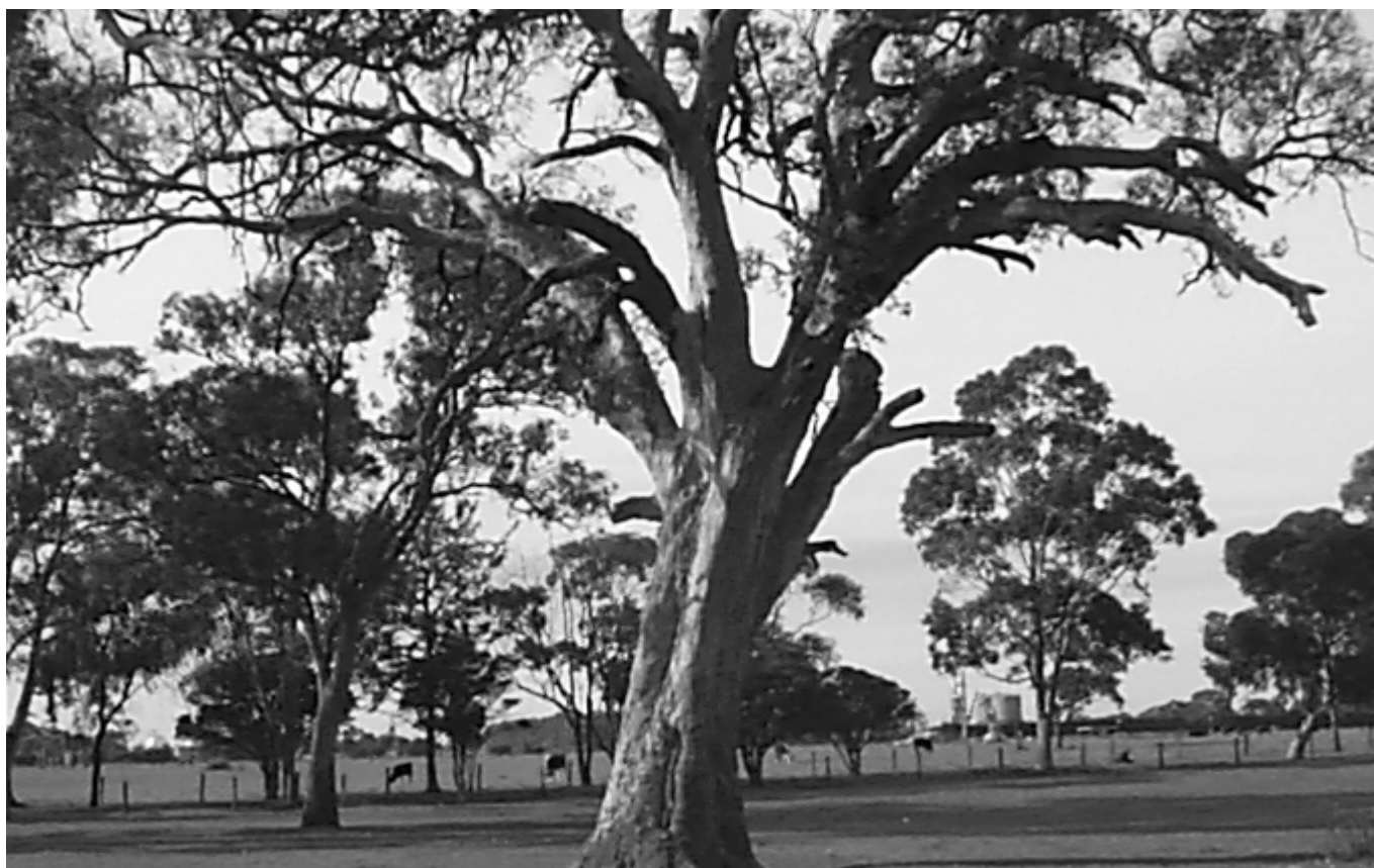
Figure 1. Greens Road Aboriginal scarred tree