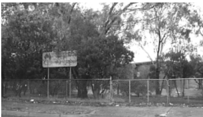
Figure 8. Enterprise Hostel Migrant Centre

The Commonwealth Government's Enterprise Migrant Centre officially opened in Springvale, off Westall Road, on 29 October 1970 and had a major impact on the surrounding area. It was said to be the 'first entirely new migrant hostel to be completed in Victoria under the Australian Government's hostels rebuilding program' and cost approximately $4 million to build and equip. It was designed by the Commonwealth Department of Works to accommodate about 1,000 people and included 250 family units. One of 27 hostels run by the Government agency, Commonwealth Hostels Limited, the role