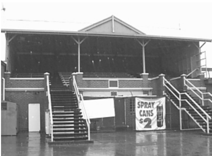
Figure 26. Springvale Football Ground grandstand