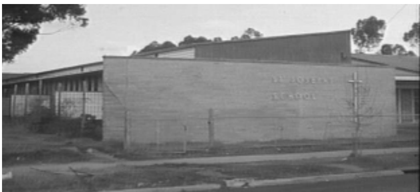
Figure 21. St Joseph's Catholic School Buckingham Avenue.

This language centre developed intensive courses for children of non-English-speaking background. It was initially located in the Noble