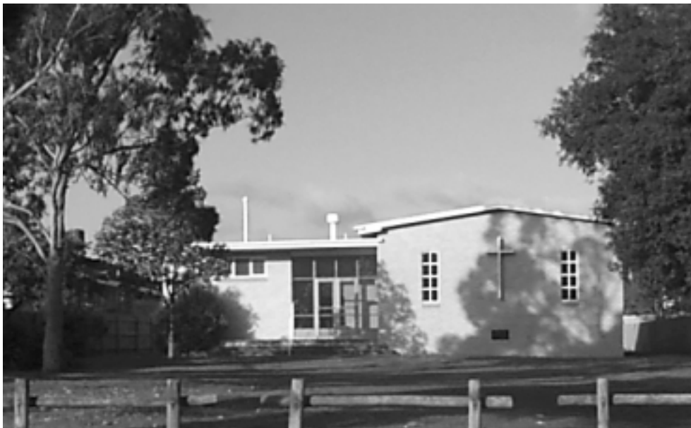
Figure 5. Pickett Street Lutheran Church, Dandenong