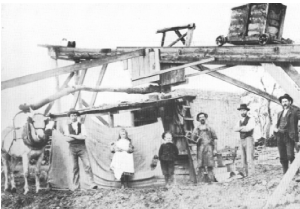
Figure 2. Ordish Firebrick Co 1904 (Brennan)

The quarrying of sand began in the Springvale area in the 1930s, in the vicinity of Clarke Road. Two small companies were operating during the 1940s, but after 1945 found that there was a huge demand for concrete sand and expanded the existing pits. There were five sand pits operating in 1953 along Clarke Road, and further pits in Rowan and Spring Roads. In 1976, 76% of Melbourne's sand requirements