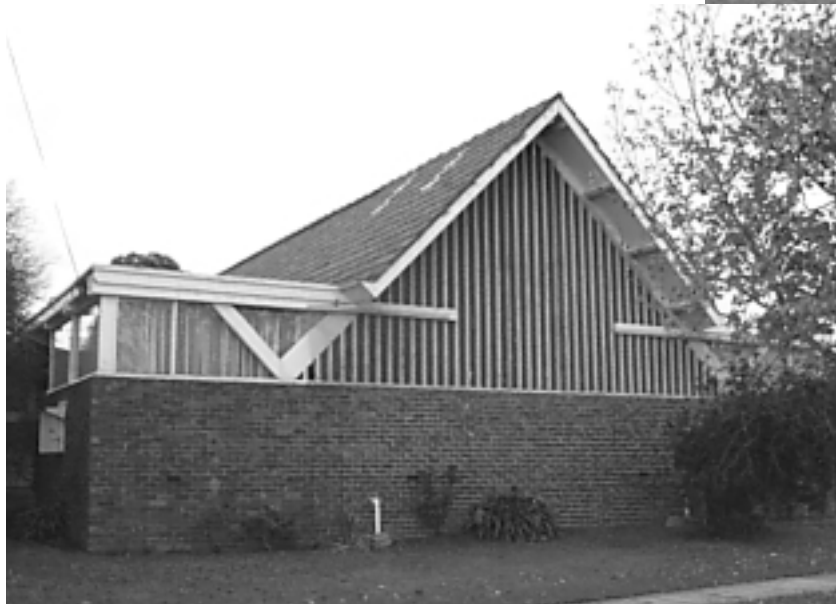
Figure 30. Dandenong Presbyterian Church, designed by Chancellor & Patrick