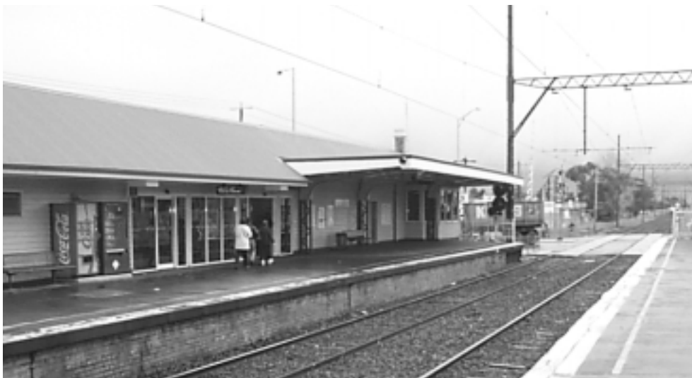
Figure 17. Springvale Railway Station (extended from its original form)