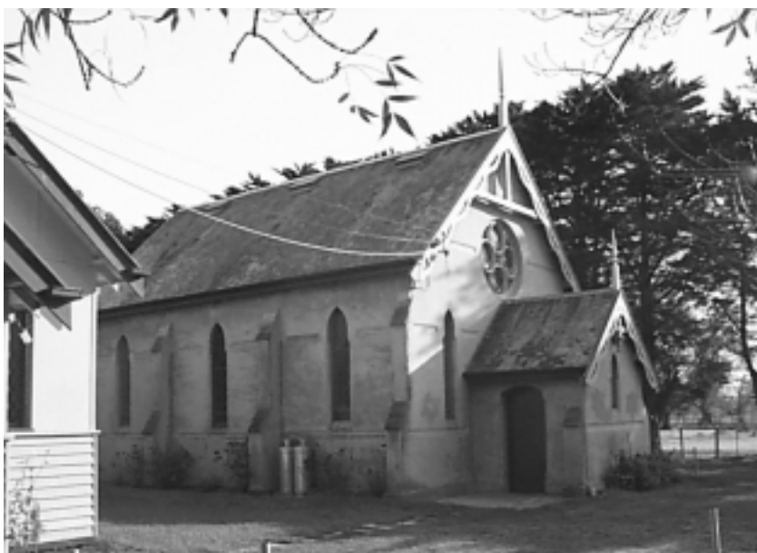
Figure 4. Keysborough Uniting Church

who established an Aboriginal settlement at Nerre Nerre Warren and George Robinson, Chief Protector of Aborigines (Hibbins, 1984: 17-20).