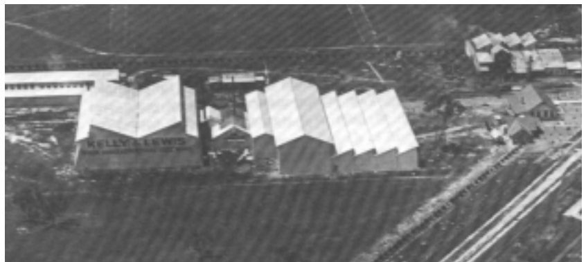
Figure 12. Kelly & Lewis from the air c1926 (Hibbins)

Nissan was the largest international firm to establish a manufacturing plant in the area. The Japanese firm began assembling Datsun cars in Australia in the mid 1960s in Sydney and from 1977 at Clayton. It opened its National Parts Distribution Centre at Dandenong in 1981 and a new aluminium casting plant in 1982 ( Hooper, 1988: 24-5). It also established its Technical Training Centre and its head office on adjoining sites.