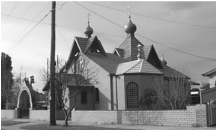
Figure 7. Russian Orthodox Church, Dandenong

In 1961, the overseas-born (almost entirely from Britain and Europe) comprised 25 % of the combined population of the City of Springvale and the City of Dandenong. It should be noted that the present City of Greater Dandenong comprises all of the former City of Dandenong and 70% of the former City of Springvale, with some small additions from other municipalities. The proportion of overseas-born increased to 32% by 1971. In both municipalities the proportion of people born overseas increased each year to the point in 1991 where the overseas-born were 46% of the population (Australian Bureau of Statistics, Census, 1961; City of Greater Dandenong, 1996).