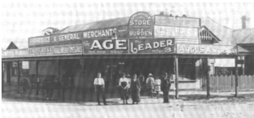
Figure 16. Burden's store, Springvale