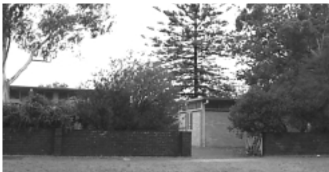
Figure 31. Lutheran Church, Dandenong