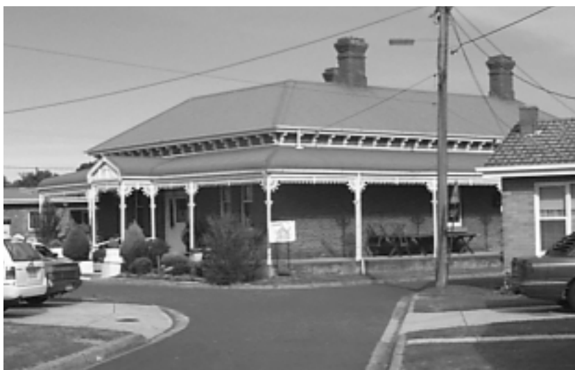
Figure 37 Thuruna, Dandenong

In 1966, Springvale Council transferred some land within Ericksen Gardens to the City of Springvale Elderly People's Society who were raising funds for housing. The Housing Commission of Victoria used this land to build 21 units in Springvale and also built 25 units in Mons Parade, Noble Park (Hibbins, 1984: 215-216). Springvale Council helped to finance a hostel for the frail aged, in Springvale Road, and this was opened in 1978.