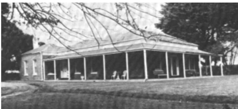
Figure 3. Glen Alvie, Keysborough, Keys family homestead; original section built in 1841/2