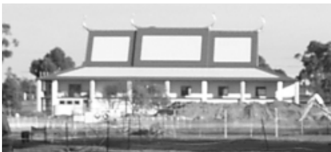
Figure 9. Springvale Road Bright Moon Buddhist temple

Springvale Road. The Bright Moon Temple in Springvale is probably the most striking example of the Asian impact on the cultural landscape of the Greater Dandenong area.