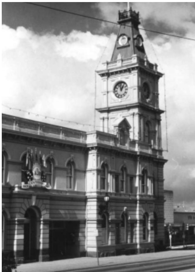
Figure 24. Dandenong town hall

(State Library of Victoria by John T Collins, c1974)