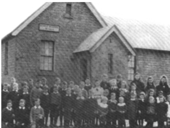
Figure 18. Keysborough State School c1895