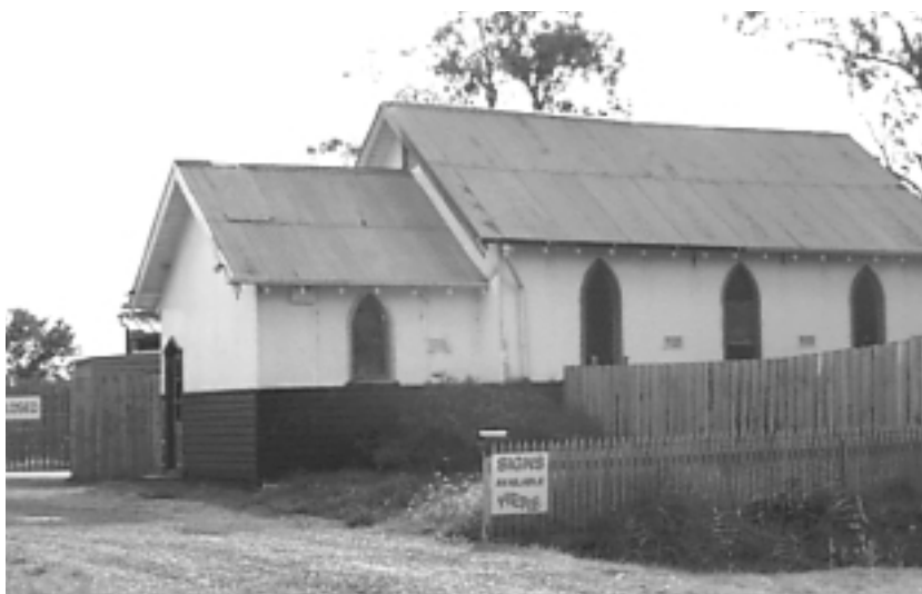
Figure 29. Methodist church at Bangholme