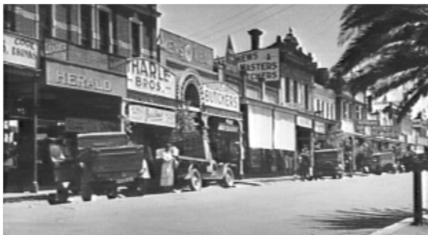
Figure 13. Lonsdale St market day 1906 (Brennan)