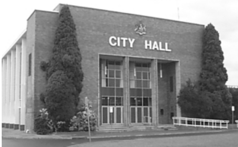
Figure 25. Springvale City Hall