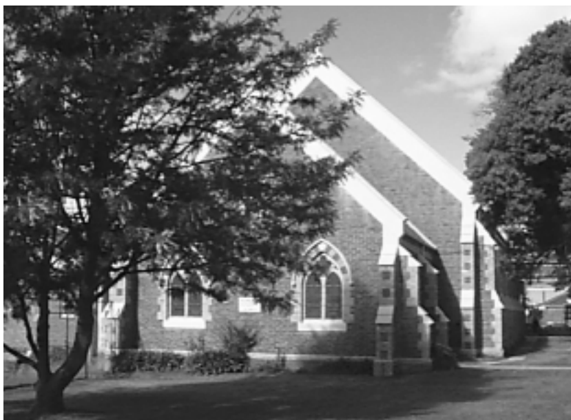
Figure 28. Dandenong Uniting Church (rear)

During these years, most of the congregations developed a complex of buildings, with church, hall, and house for resident priest, minister or pastor. The first Roman Catholic presbytery at Dandenong was built in 1885 (demolished 1967). The Dandenong Methodists built a second parsonage, large and costly, in 1887 (still surviving) and the Presbyterians had a manse for their resident minister by 1890 (demolished).