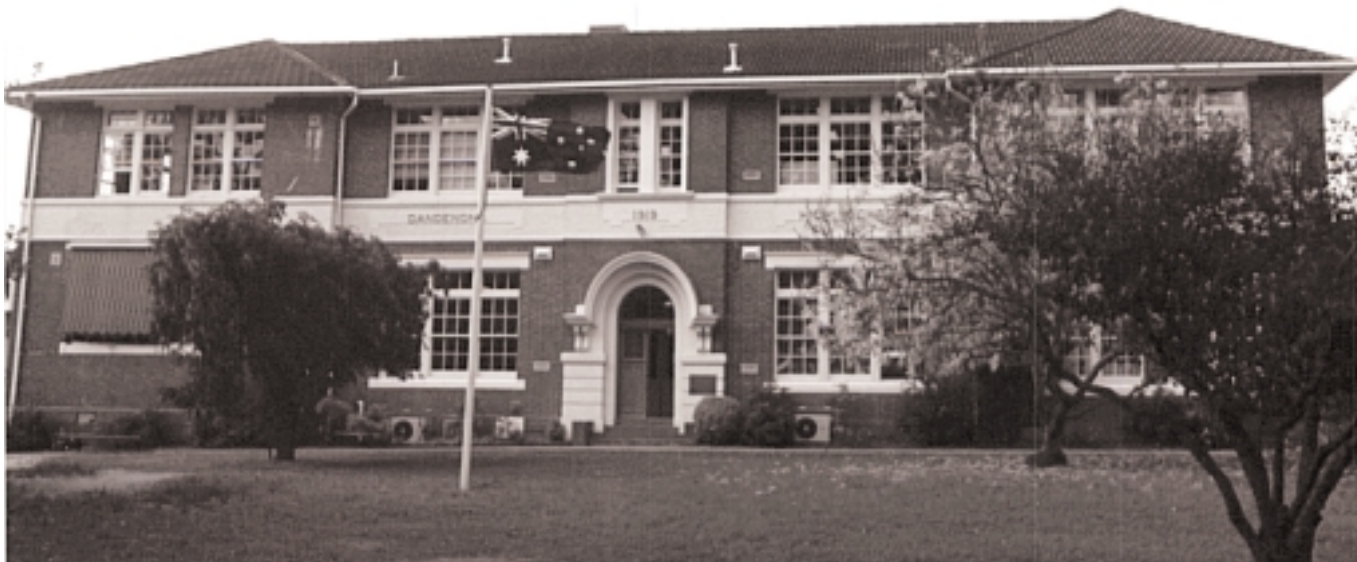
Figure 22. Dandenong High School

1954, represents this demand. There was an unprecedented jump in secondary school enrolments and the Education Department devised a new method of 'Light Timber Construction'. Springvale High School was amongst the first nine high schools to use the timber-framed, concrete tile-clad schools in 1954. They were to be built in sections over three to four years (Blake, 1973, vol. 1: 527-531). The site of the new high school, a grazing paddock off Sandown Road, was 12 acres in extent. Enrolments increased rapidly and reached over 1,000 by 1962 (Blake, 1973, vol. 1: 588-599).