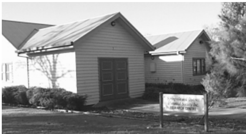
Figure 33. Springvale & District Historical Society HQ