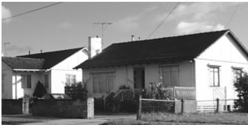
Figure 10. Dandenong North Housing Commission of Victoria estate

By June 1956, the Housing Commission had completed construction of 732 dwellings in Dandenong (Victorian Parliamentary Papers, 1955-6, vol. 1: 967-968). By 1958, the Commission had built 67 houses in Springvale (VPP, 1957-8, vol. 2: 519).