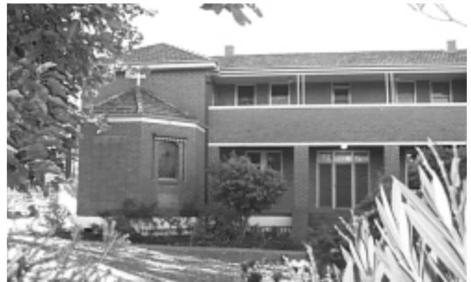
Figure 23. Killester, Springvale