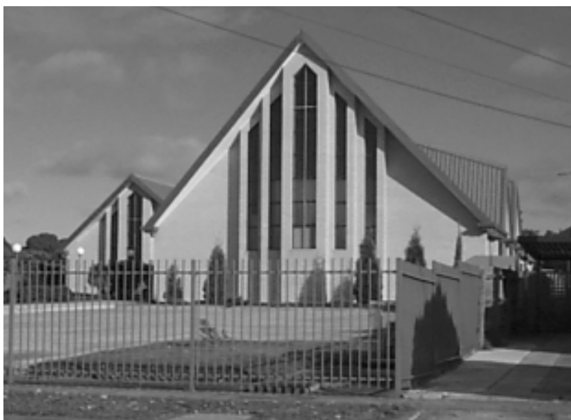
Figure 32. Polish Seventh Day Adventist Church, James St

Some of the newer places of worship were impressive architecturally and innovative in concept. The parish centre for the Church of the Resurrection was described as 'a struggle in creating a new style based on local suburban motifs' The parish complex included a church, parish centre, primary and secondary school, childcare centre, learning centre and units for the elderly.