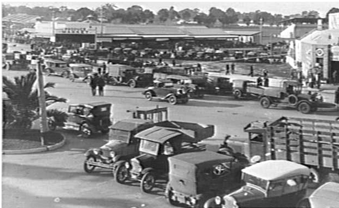
Figure 14. Dandenong market 1930s