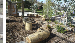
TYPICAL NATURE PLAY