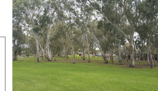
TYPICAL INFORMAL PARKLAND