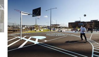
TYPICAL MULTI PURPOSE HARD COURT