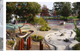
TYPICAL DISTRICT PLAY SPACE