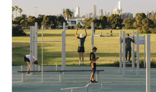
TYPICAL OUTDOOR GYM