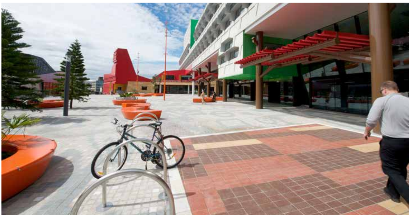
It would not be an overstatement to suggest that this Centre – with its Library, state of the art community facilities, civic square, next generational screen, community meeting spaces and commercial rental opportunities – has exceeded all expectations. (John Bennie, CEO)

Capital investment was at an unsustainably high level in 2013-14 influenced significantly by the capital cost of construction of the Greater Dandenong Civic Centre. $63.58 million was expended on all projects in this year of which $14.67 million was dedicated to asset renewals. It is most important that a properly determined ratio of renewal and refurbishment : total project investment is maintained to ensure that previous infrastructure investments remain at standards that are serviceable and reflect highly on the city. Council monitors this ratio very closely over time.