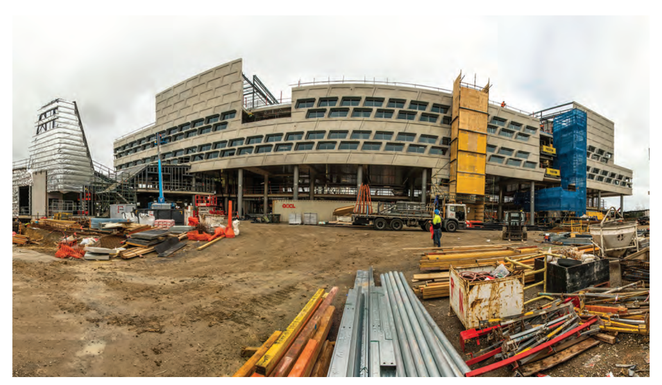
Council's new Municipal Building, located in the heart of Dandenong on the corner of Walker and Lonsdale Streets, commenced construction in 2012 and will be completed by March 2014. The site will feature new Council offices and Council Chamber, a new state-of-the-art regional library, an outdoor space complete with a giant TV screen, cafes and a range of community meeting rooms.