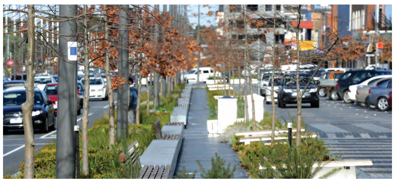
Council's beautifully installed planter boxes in Lonsdale Street, Dandenong are part of the revitalising central Dandenong projects. Over 2000 plants, 2300 trees and 16,000 perennials were planted this financial year to improve the look of streetscapes and parks around the municipality.