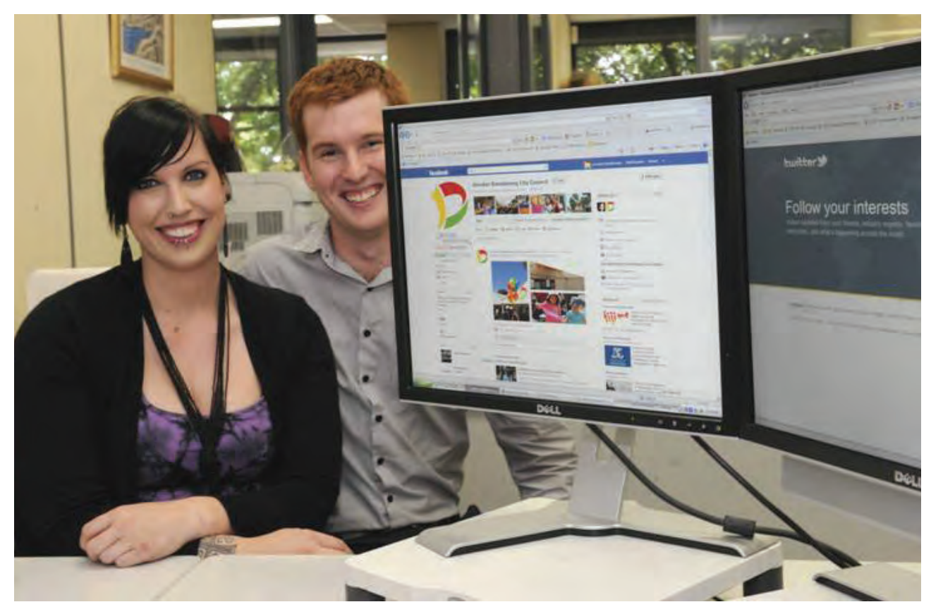
Social Media achieved significant milestones throughout this financial year with an increase in visits of 74 per cent to our Facebook page, an increase of 77 per cent followers on Twitter and a total of 3222 videos viewed on our YouTube channel.