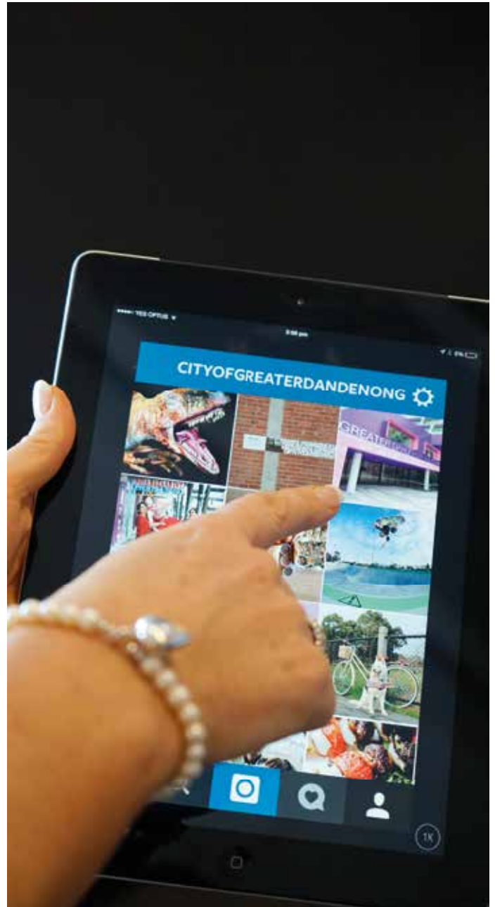
Council uses social media platforms such as Instagram to connect with the community and keep them updated on news and events.

Online engagement through social media has continued to increase, with an increase in uptake on Greater Dandenong's official Facebook page of 138 per cent; official Twitter feed of 57 per cent; and 1492 followers gained on the official Instagram feed since it was established in July 2014.