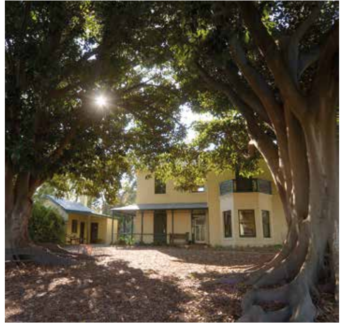
Heritage Hill Artists' Residence Benga House.