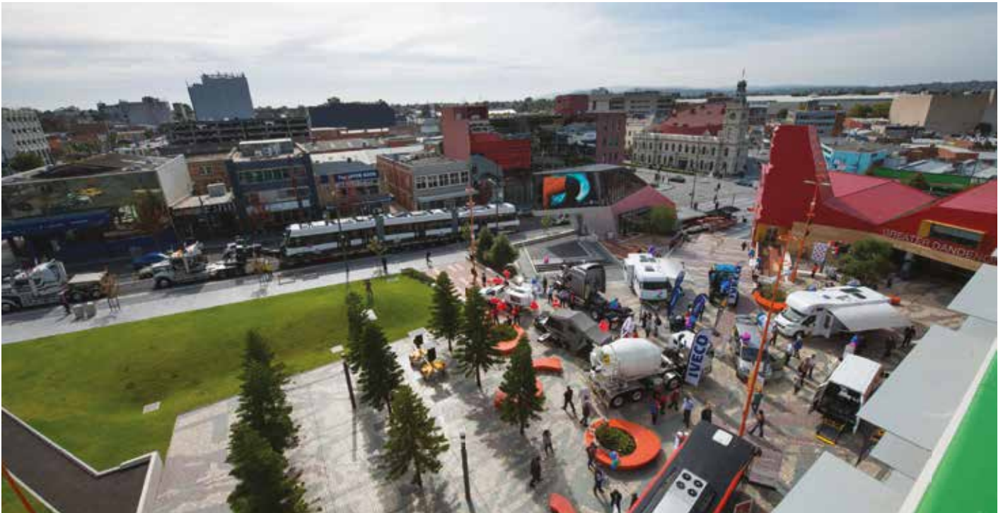
Celebrating manufacturing – Dandenong on Wheels.