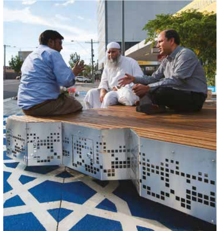
Award winning Afghan Bazaar streetscape enhancements.