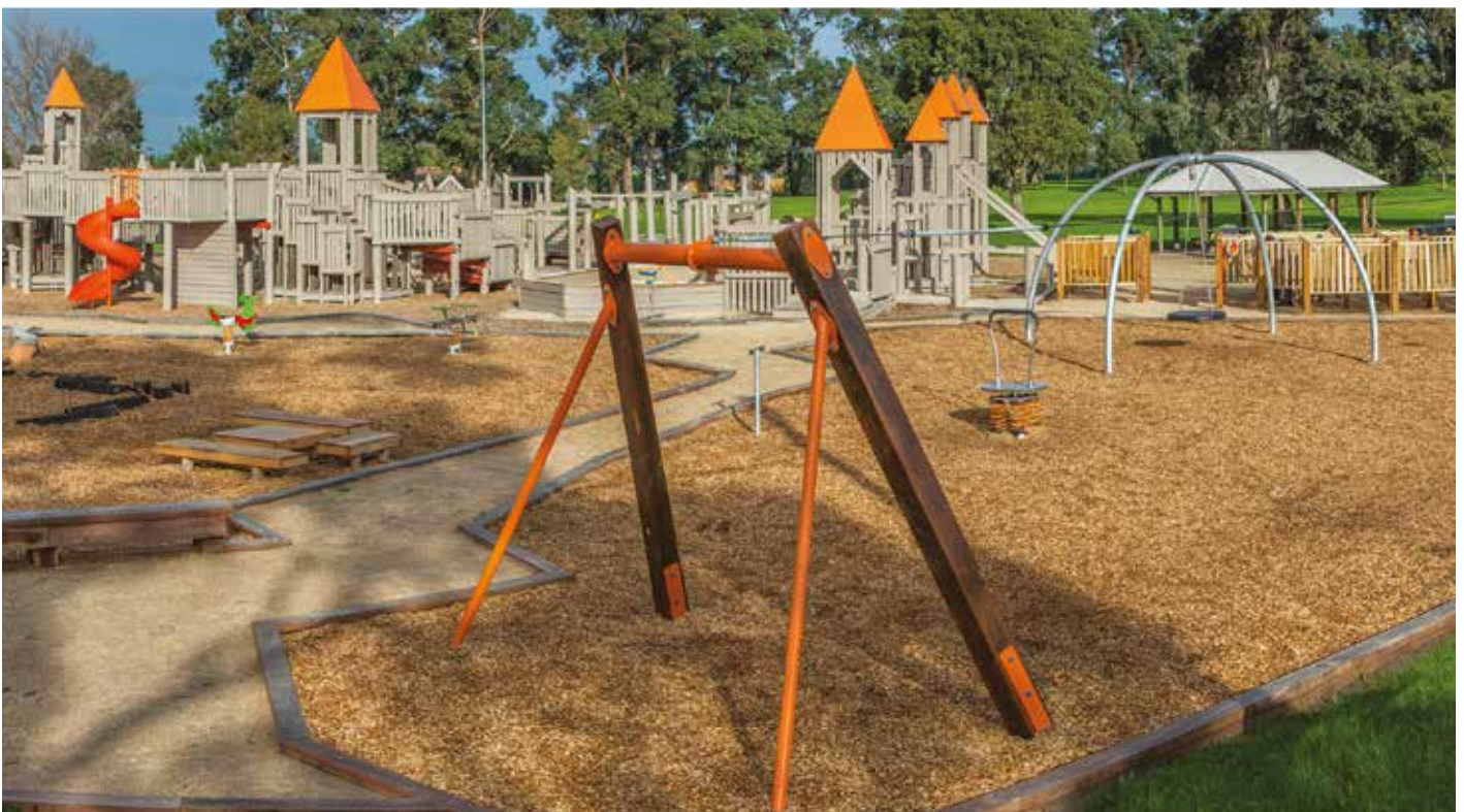
Burden Park, Springvale