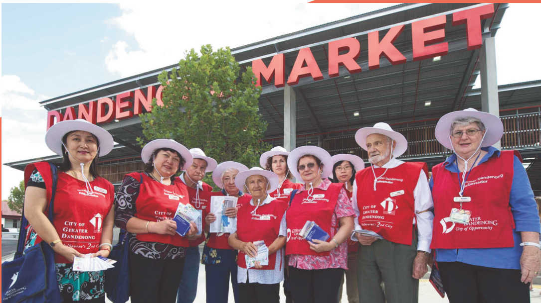
Volunteers providing an invaluable service to the community