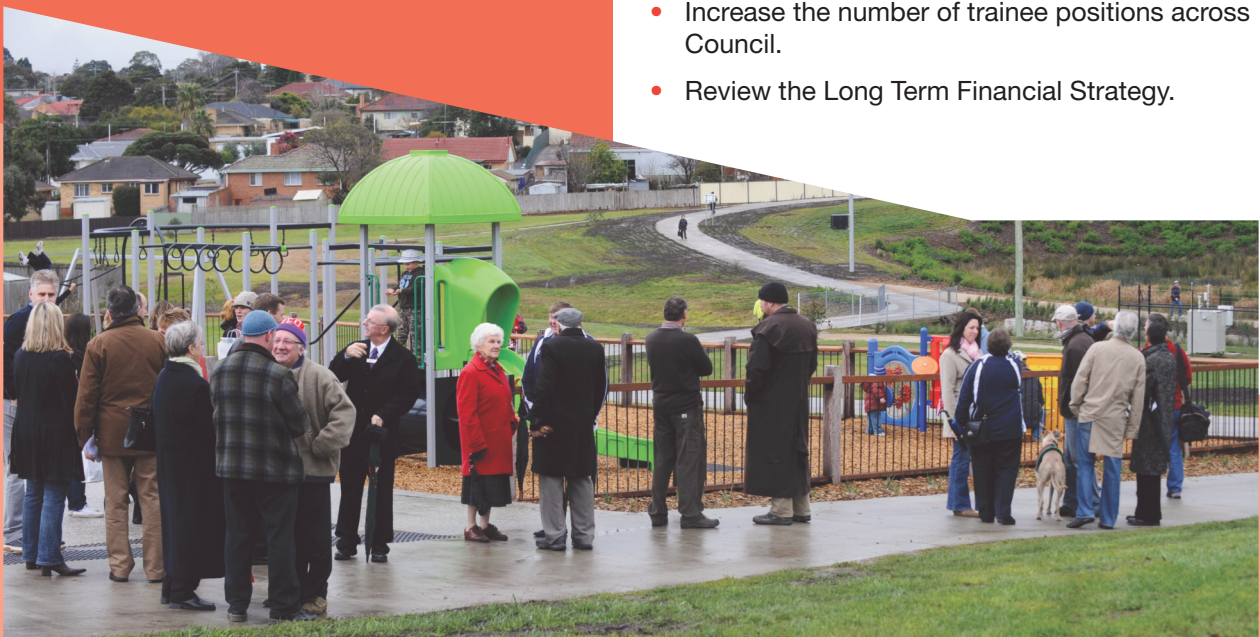
Opening of newly constructed playground at Oakwood Park