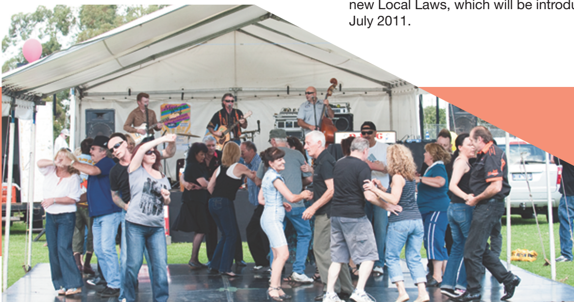
Music in the Park at Burden Park