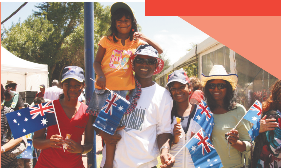
2010 Australia Day Celebrations at Dandenong Park