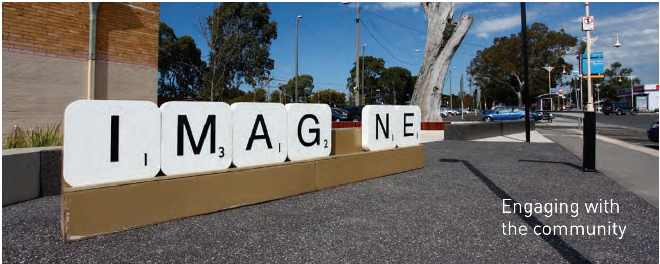
Engaging with the community