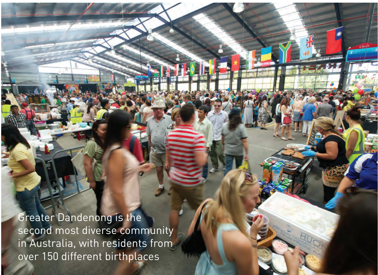
Greater Dandenong is the second most diverse community in Australia, with residents from over 150 different birthplaces