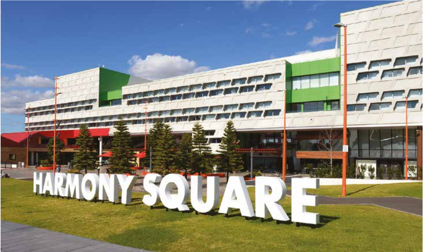
Dandenong's new Civic Square has been named Harmony Square to reflect the diversity and character of our city.