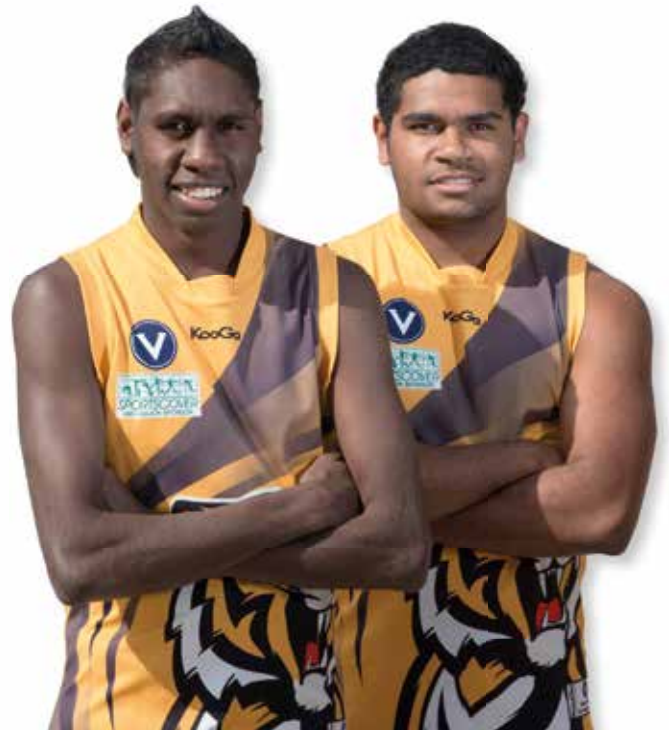
Masala Football Club, based in Noble Park North, is a local club dedicated to diversity and bringing new players to Australian Rules Football.

Nearly two-thirds of the residents of Greater Dandenong speak languages other than English – the largest proportion in Victoria and twice the metropolitan level. Among the more widely-spoken languages in this community are Vietnamese, Khmer, Chinese, Greek, Punjabi and Sinhalese. One in seven residents however has limited fluency in spoken English – four times the metropolitan level.