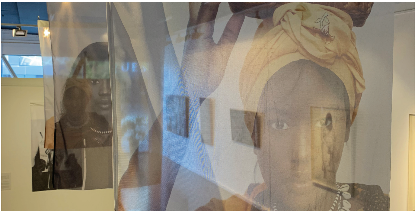
Image: Vonda Keji, Dichotomy , photographic series printed onto polyknit fabric, 2016

If you could have a flag that represents who you are, what would it look like?