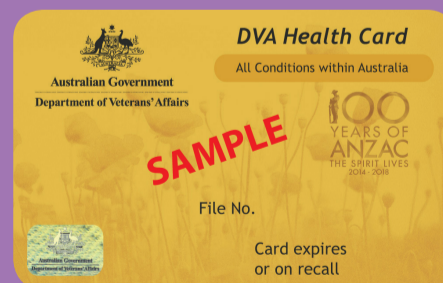
Veterans' Affairs War Widow Gold Card