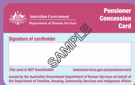
Centrelink Pensioner Concession Card

For information on concession programs please call the Concessions Information Line on 1800 658 521 (toll free) or visit www.dhs.vic.gov.au/concessions .