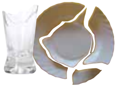
Window glass (wrapped), mirrors, Pyrex & light globes