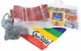
Other plastic, eg. plastic bags, plastic plant pots