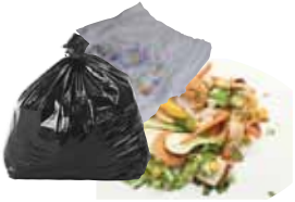
Rubbish, nappies (wrapped), ceramics, meat, etc.