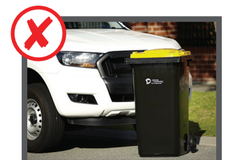
On the road, pathway or driveway

Need to know your garbage day? Visit greaterdandenong.vic.gov.au/waste or call 8571 1000