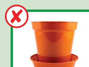
No plant pots