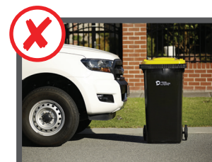
Next to parked cars