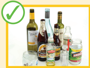
Empty glass bottles and jars