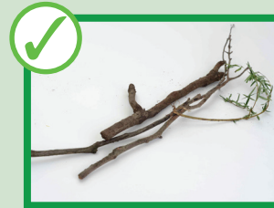
Small branches. Sizing for branches 10cm x 30cm