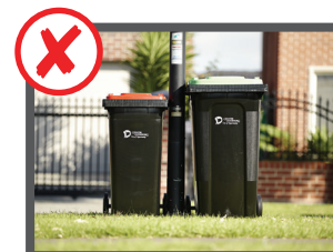
Near power poles and lines