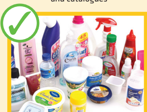
Empty plastic bottle and containers