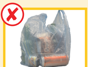
No recycling in bags