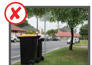
Under large trees and branches