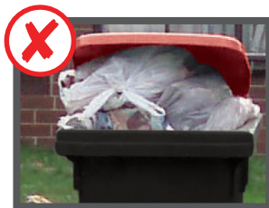
Overloaded (lid cannot close)