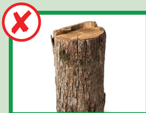
No logs or stumps