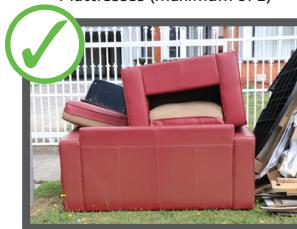
General household furniture and other items