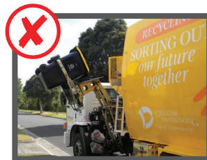
Too heavy (80+kg)