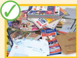
Newspapers, magazines, papers, envelopes, letters, telephone books and catalogues