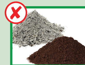
No rubble, dirt or ash