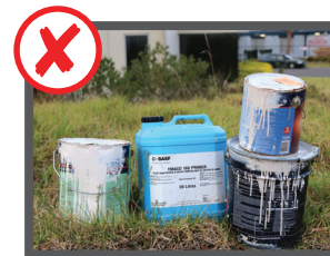
Gas cylinders, chemicals, pesticides, paint and hazardous waste