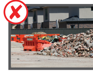
Building and renovation materials (bricks, concrete or asbestos)