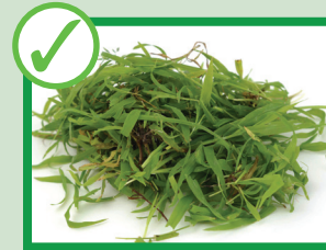
Grass clippings and weeds

Make sure your garden waste is free of soil