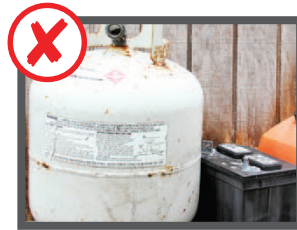
Contaminated with incorrect items