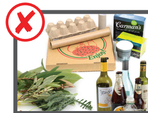
Household waste, recycling products, garden waste