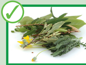
Leaves and garden prunings