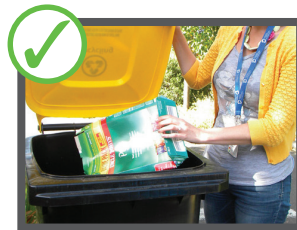
Place materials loosely into your recycling bin