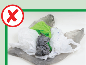
No plastic bags