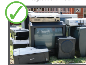
Televisions and computers