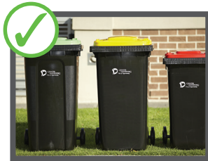
Close your bin lid to avoid spillage and litter