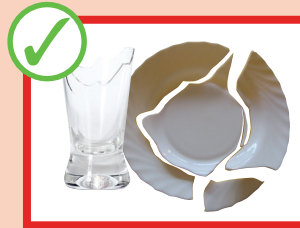
Ceramics and broken glass