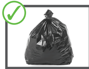
Bag your general waste