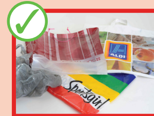
Plastic bags and wrapping