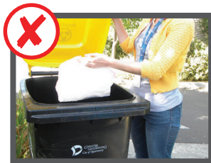
Don't put plastic bags in recycling bin