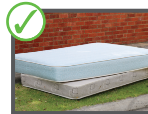
Mattresses (maximum of 2)