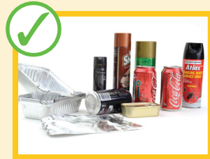
Clean foil trays, empty aluminium, steel, and aerosol cans

Don't overfill your bins and place recycling materials in loosely