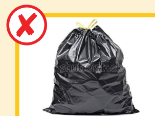
No general waste