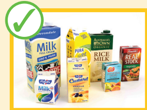
Milk and juice cartons