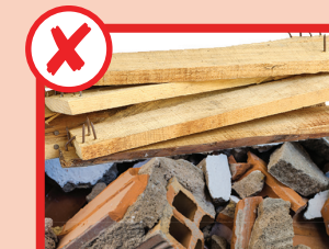
No timber and building materials