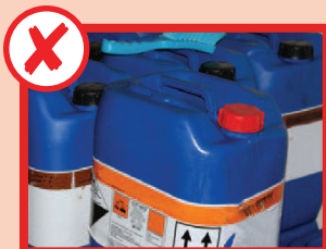
No hazardous chemicals