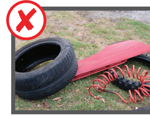
Car parts, tyres, batteries and engine blocks