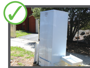
Whitegoods and metals