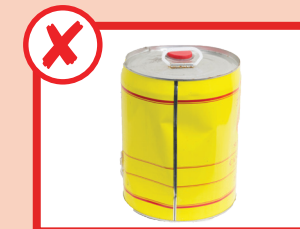
No paint, oil or liquids