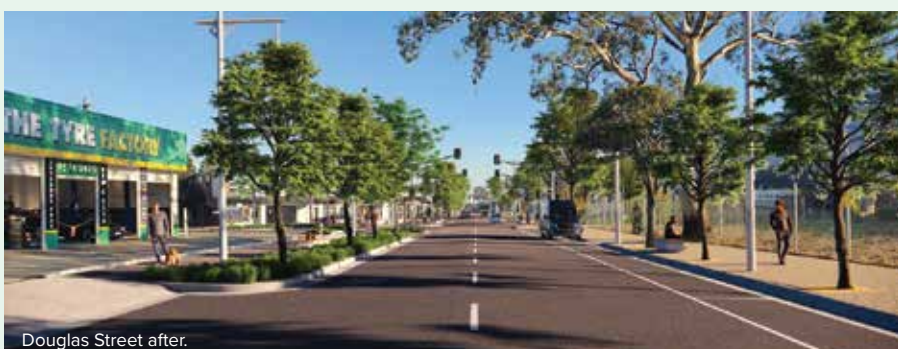
Douglas Street after.

Learn more: greaterdandenong.vic.gov.au/works-and-projects/douglas-street-streetscape-upgrade-project