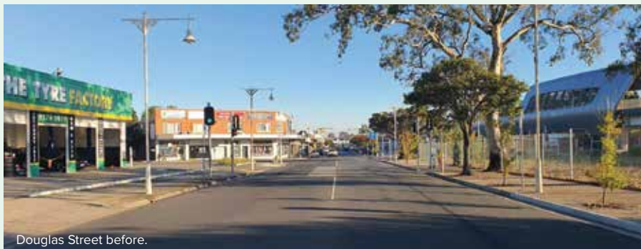
Douglas Street before.

Learn more: roadprojects.vic.gov.au/pound