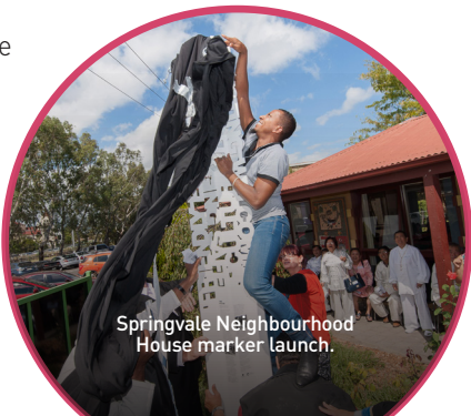
Springvale Neighbourhood House marker launch.

In response to community demand, the City of Springvale built the Springvale Neighbourhood House in 1984. From that time many of the cultural groups who had arrived at the Enterprise Hostel in Springvale contacted the Springvale Neighbourhood House and, with its assistance, established support groups for their emerging communities. This helped them to settle successfully in the local community. Many of these people are still involved with the 'House'.