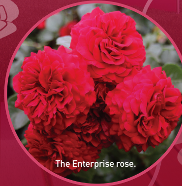
The Enterprise rose.

Exploring the history of the Enterprise Migrant Hostel and sharing the positive stories of the impact its residents and staff had on the development of Springvale