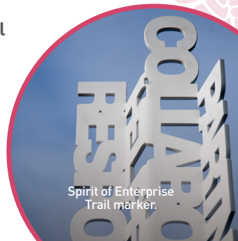
Spirit of Enterprise Trail marker.