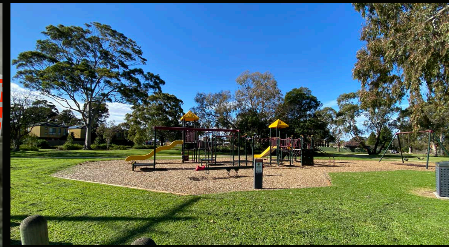
Existing playground in park