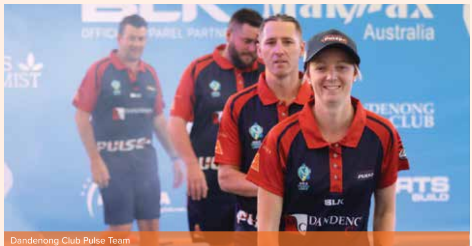
Dandenong Club Pulse Team

Growth for the sport has been stimulated by the Club's vision for it to be the hub of bowls for Melbourne's south east. The Club joined the national scene by establishing teams to compete in Bowls Australia's BPL competition and a new independent competition, The Ultimate Bowls Championship.