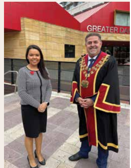
Newly elected Mayor Jim Memeti and Deputy Mayor Eden Foster.

The Mayor and Councillors wish you a safe and joyous festive season, and the very best for the new year.