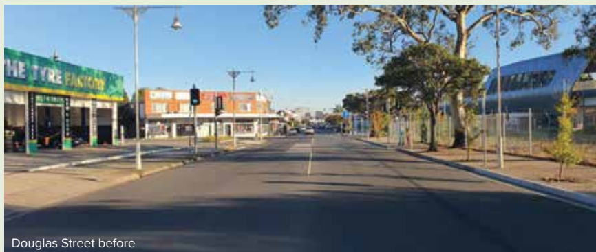
Douglas Street before

“The investment will enhance visitor attraction to the Noble Park activity centre, complement current business initiatives, and build upon the suburb’s sense of community spirit and much-loved village character.”