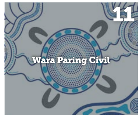
Wara Paring Civil