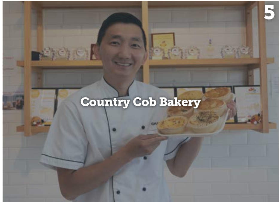
Country Cob Bakery