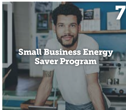
Small Business Energy Saver Program