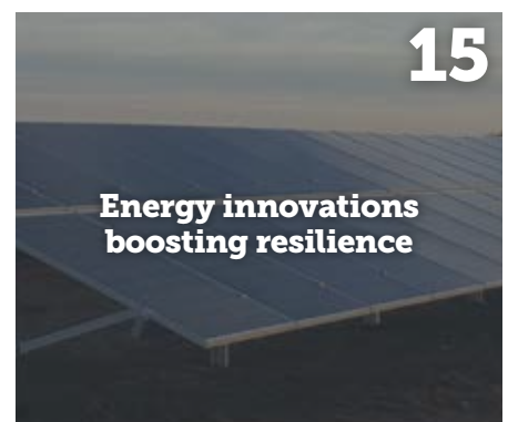
Energy innovations boosting resilience