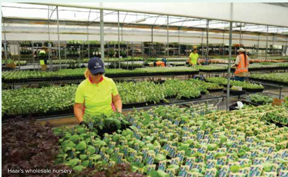
Haar's wholesale nursery

Keep an eye on your inbox for updates and invitations and/or email onepercentproject@cgd.vic.gov.au to register your interest.