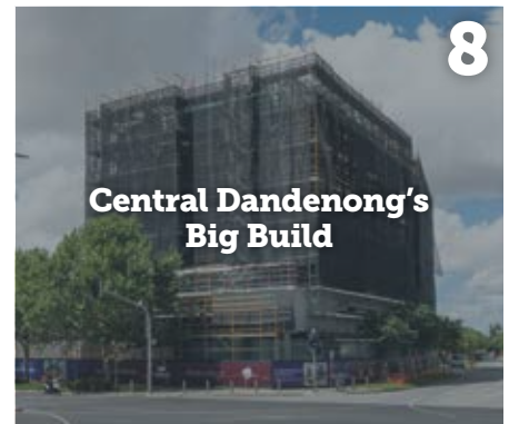
Central Dandenong's Big Build