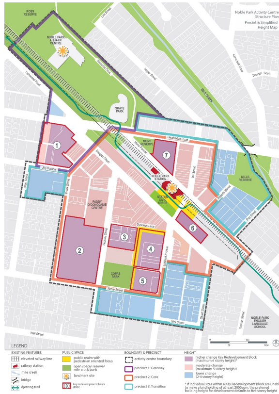
Figure 1: Noble Park Major Activity Centre boundary

The amendment applies to all land within the designated Noble Park Major Activity Centre boundary as per the Noble Park Major Activity Centre Structure Plan, as shown in Figure 1 below.