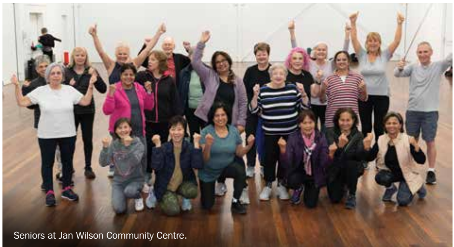
Seniors at Jan Wilson Community Centre.