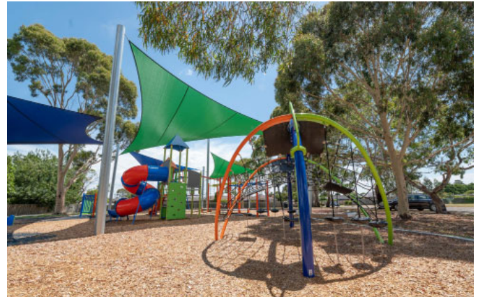
Noble Park Reserve - new neighbourhood playground