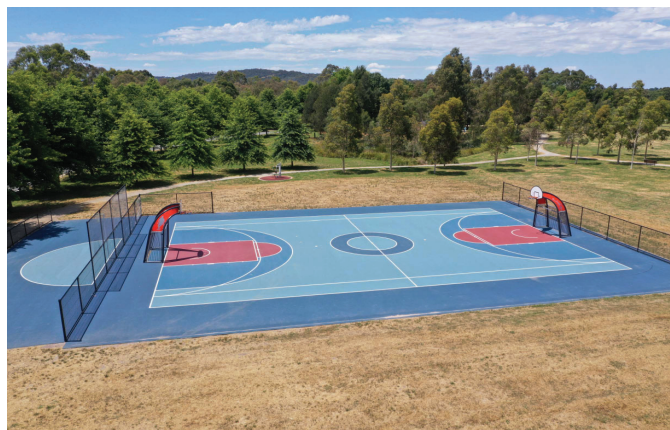
Tirhatuan Park - new multi-purpose courts