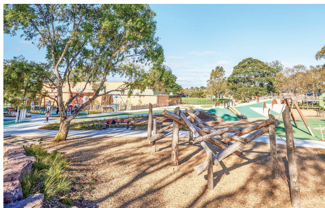
Ross Reserve - All Abilities Playground (stage 1)