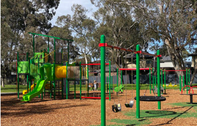
JB Sheen Reserve - new neighbourhood playground