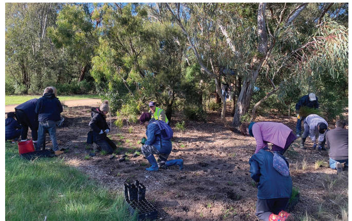
Community tree planting day at Tatterson Park

The area of focus is increasing the tree canopy coverage within our parks to respond to the long term need to grow a mature tree canopy cover that provides shade and a cool environment for the community to enjoy. In addition, the focus on increasing tree planting coverage as well as where appropriate more diverse garden bed planting can occur contributes to the biodiversity of our municipality. Throughout the year, Council runs school educational programs, as well as community planting days that increase the indigenous tree and garden bed coverage in reserves across the municipality. Planting days at Tirhatuan Park and Alex Wilkie Nature Reserve receive great support from the community.