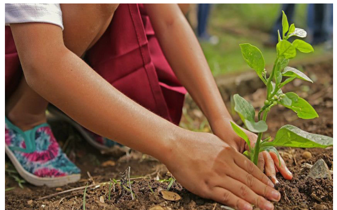
Maralinga Community Garden (Chandler Reserve) in Keysborough

These documents are available on Council's website and have been created to help local community groups through the process of starting up a community garden on Council owned and/or managed public open space land. The new Maralinga Community Garden Inc was opened in early 2022 at Chandler Reserve in Keysborough.