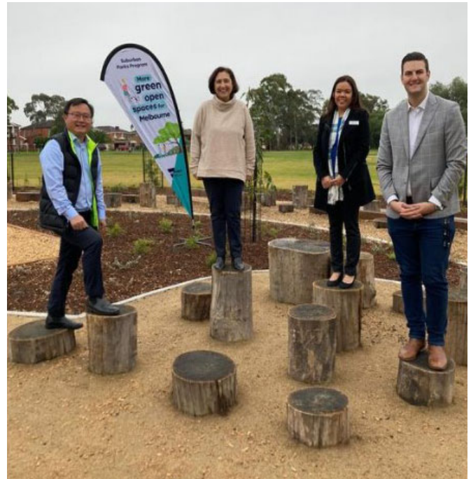
Alan Corrigan Reserve - Official reopening by Minister Lily D'Ambrosio