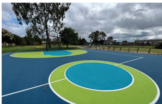
Glendale Reserve - new half court