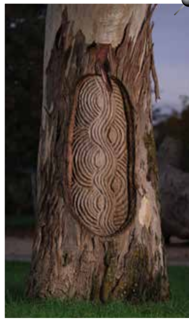
Scar tree in Dandenong

As an organisation Greater Dandenong City Council will support a yes vote, however Council believes the public has the right to choose which way they want to vote.