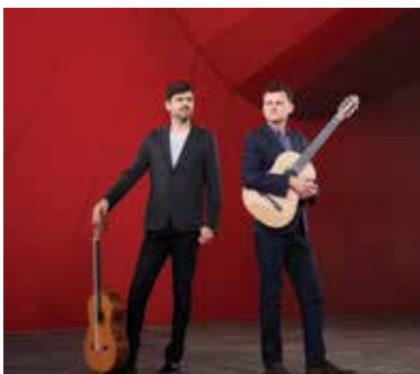
This is Us - A Musical Reflection of Australia

This mix of performances will have you calling 'Encore' at the iconic Drum Theatre.