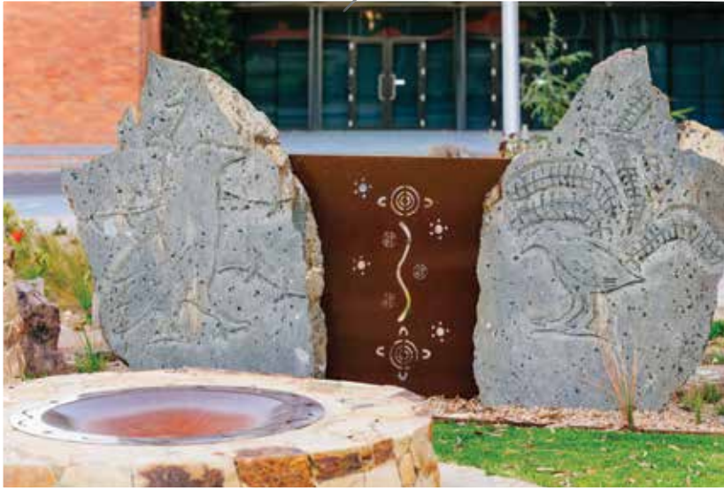
Waa and Bulln Bulln Corroboree (Springvale Ceremonial Fire Pit)